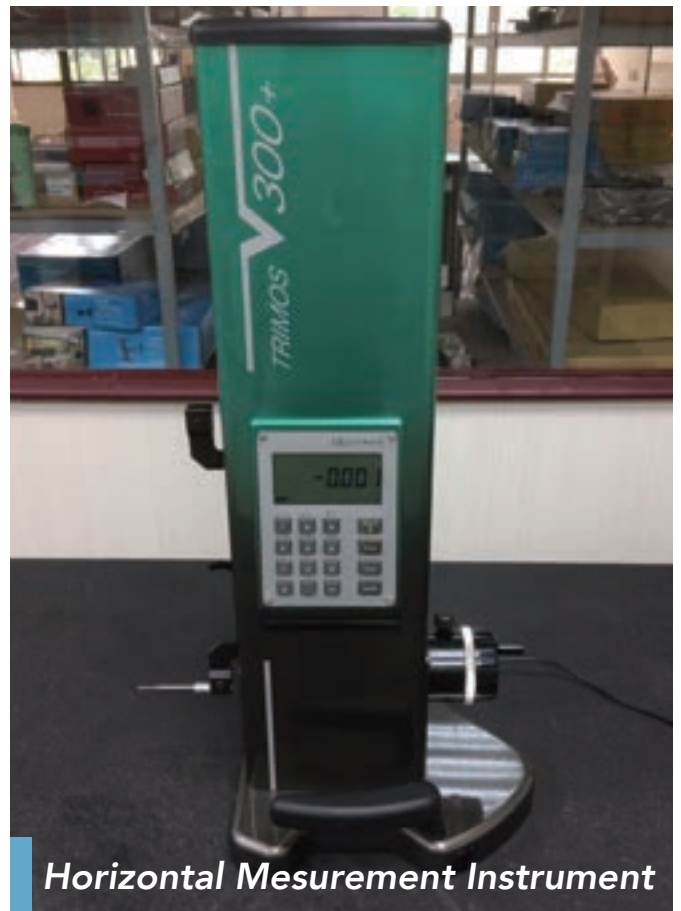
Horizontal Measurement Instrument