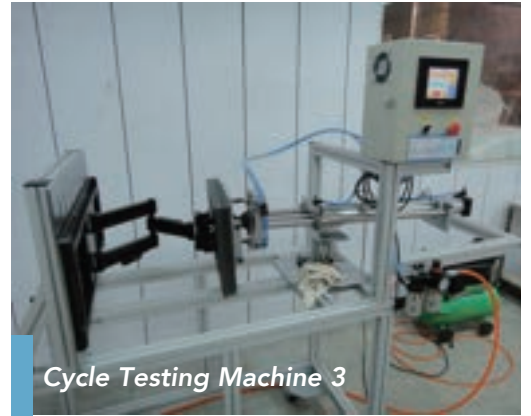
Cycle Testing Machine 3