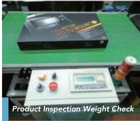
Product Inspection Weight Check